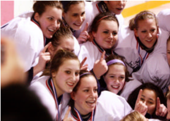
Four years in a row...a hockey dynasty has been created at SMA !!!

On Wednesday, March 26 th the Flames Hockey Team defeated St. James Collegiate 2-1, in overtime, to win the WWHSHL Division 1 championship, making it four years in a row. This was also the seventh win in eight years for the team. That's quite a record!